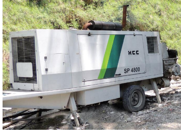
Concrete pump is the heart of the operation. It can be operated on 2 sides - piston side (for Long distance) and rod side (for short distance)